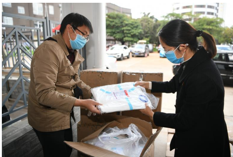
Yuxi Government officials unpacking UNOSSC-donated protective suits.

To find out more, please visit South-South Galaxy.