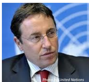
Achim Steiner UNDP Administrator

COVID-19 was declared a pandemic by the World Health Organization (WHO) on 11 March 2020. Since it emerged in December last year, the virus has spread to every continent except Antarctica and has become a defining global health crisis of our time. The United Nations Secretary-General calls for world leaders to come together and offer an urgent and coordinated global response. The United Nations Development Programme (UNDP) is committed to helping countries to urgently and effectively respond to COVID-19 as part of its mission to eradicate poverty, reduce inequalities and build resilience to crises and shocks.