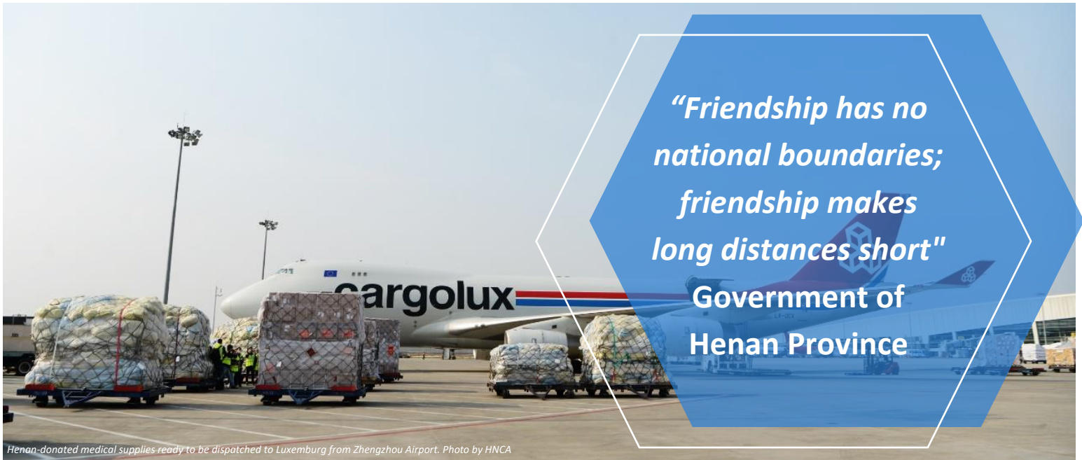
Henan-donated medical supplies ready to be dispatched to Luxembourg from Zhengzhou Airport.