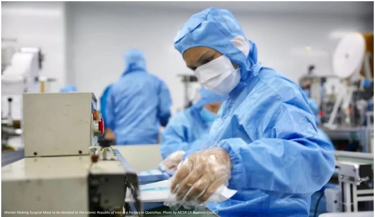
Worker Making Surgical Mask to be donated to the Islamic Republic of Iran in a Factory in Quanzhou.